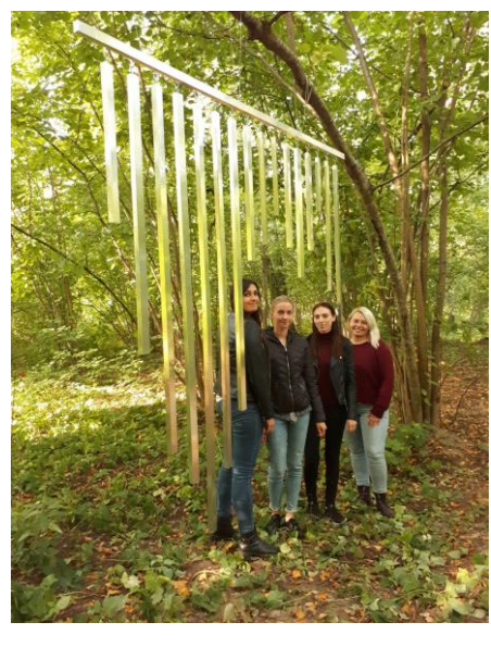
The heartbeats of Eleja manor