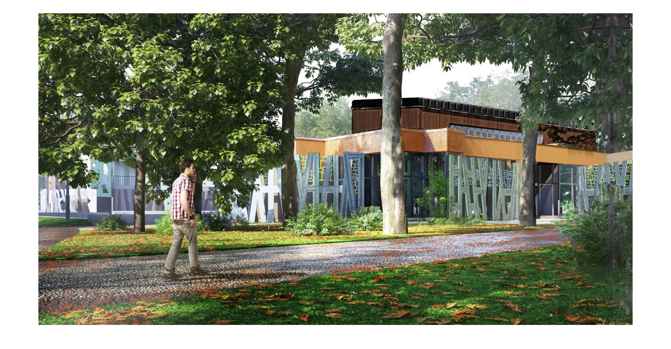
Exhibition hall in Eleja Manor park/ (423,4 m2)