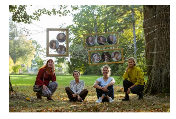
History in networks